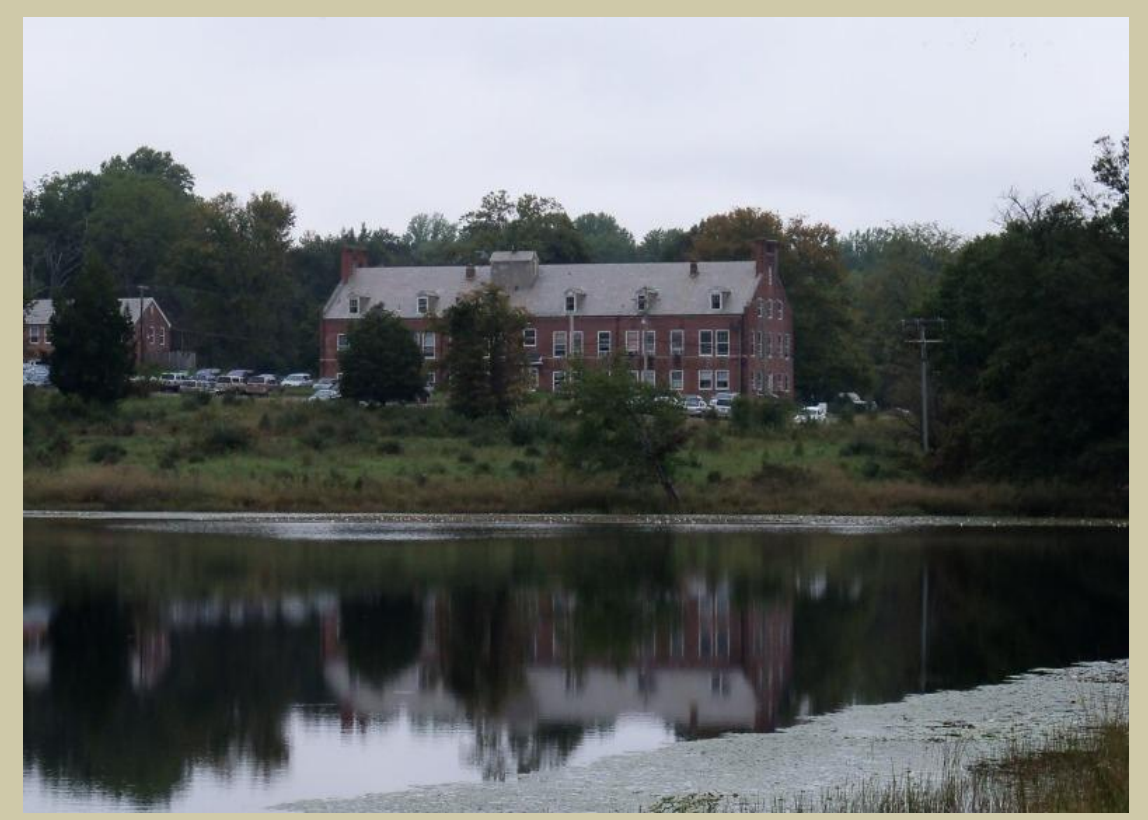
(Merriam Laboratory at Patuxent Research Refuge, built with the assistance of the WPA.)

Reflecting on my research & travels in Maryland these past few years, several amazing New Deal treasures come to mind: The city of Greenbelt, Catoctin Mountain Park, Camp David, artwork in post offices across the state, Fort Hill High School in Cumberland, Glen Woods at Towson University, and the forests & parks of Garrett County, to name just a few. For me, however, the most impressive New Deal site in Maryland is Patuxent Research Refuge (PRR).