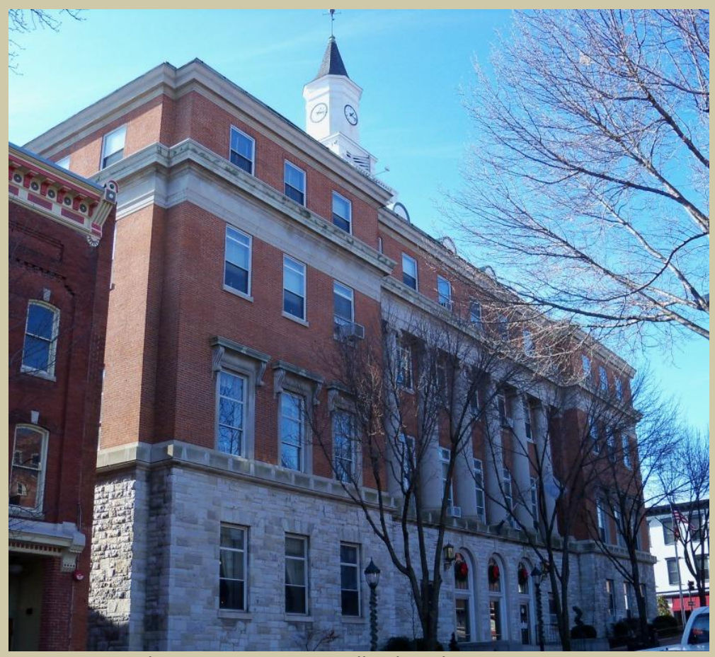
(The Hagerstown City Hall.)