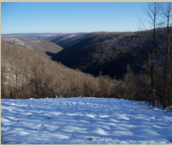
(<u>Left</u>: CCC boys at work in Maryland, image courtesy of the Library of Congress. <u>Right</u>: Snow in the western Maryland mountains, photo by Brent McKee)

Many benefits of the Civilian Conservation Corps program were, and are, overt and clearly defined. Conceived to revitalize the natural environment and to create work projects to employ youths, both of those admirable aims generated immediate benefit to nearby local populations. However, the impact of the camps upon those peoples went far beyond any initial conception or intention. These benefits were wide-ranging and their effects were long-term. These included, but were not limited to, the education of the enrollees, the mingling of young peoples, and the establishment of an emergency response program in remote areas. Each of these benefits will be discussed in more detail in future articles. In the spirit of this winter season, however, I would like to highlight the story of a forgotten & snowy rescue by the CCC boys.